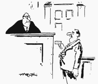
"It is Now the Clerk, I have a..."

Meters run backward as well as forward. (Smile)