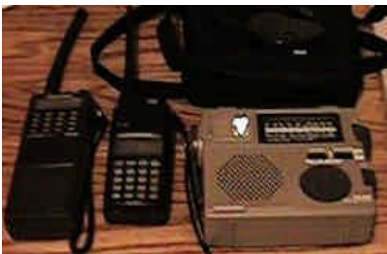
Contingency kit radios. From L to R: Radio Shack HTX-202 2-meter ham HT, Icom R-10 communications receiver, Grundig FR-200 emergency radio.

The Blackout of 2003 made one very important point for the new millennium. If you love your life, stay out of large cities, especially ones that are built on an island. There is an old saying that "If you can survive in New York City, you can survive anywhere." I feel that if you can survive anywhere, why would you pick New York City? When it comes to SHTF scenarios, you have to love NYC for its worst-case ranking. Take Manhattan for instance. It has a population greater than that of the state of New Hampshire (1.5 million vs. 1.2 million) in an area that is less than 1% the size. (22 square miles vs. 9,200). The population of NYC is generally not oriented towards self-reliance and preparedness, and would rather think "the government" will take care of them, or taker a fatalistic approach towards a potential disaster. I have a friend, a fellow old-school hacker from the 1980s, who runs his own business in Manhattan within walking distance of Grand Central Terminal. When asked after 9/11 about future attacks, he