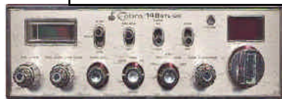
A classic top-of-the-line mobile CB unit: The SSB-capable Cobra 148GTL