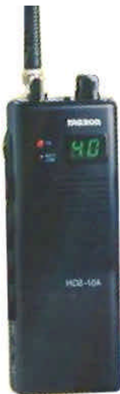
Maxon Handheld CB Transceiver

I can recall a time when the only option for legal license-free communications was Citizen's Band. Those of us who were seriously into communications went the extra mile and acquired our ham licenses, but even after getting my ticket I still used CB for its de-facto "jungle telegraph" capability. On the highway, it was unlikely that you would ever get a speed-trap report on 146.52 MHz, but all you needed to do was listen on Channel 19 and the information would usually come to you unsolicited. In 1991, I took a summer job at a Boy Scout camp in New York's Adirondack Mountains. My traveling companion during frequent weekend trips back downstate was a Radio Shack CB installed in my Ford Escort with a magnet-mount whip antenna on the roof. This provided adequate communications intelligence on my forays up and down I-87 to avoid getting any fast driving awards over the course of that summer.