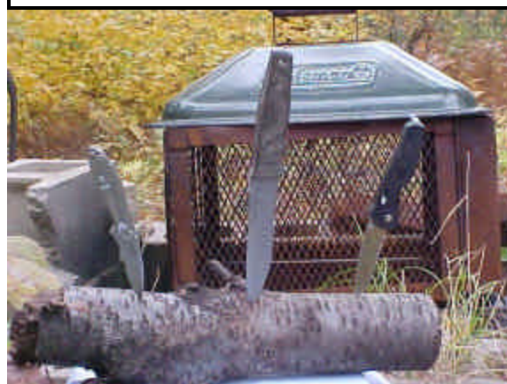
Left Kershaw Leek, Middle Camillus C.U.D.A., and Right SOG Flash.

Having good communications (commo) capability is very important for your group to have. On the active side, commo is used to keep in touch with members of your group, and to seek assistance when encountering a situation where it is required. On the passive side, monitoring other people's commo is often a way to find out conditions in your area and surrounding regions. If you feel particularly drawn to specialize in commo you can set up whole systems and help out others with their commo issues. Commo is a topic that gets pretty complicated as you get into the more advanced aspects, so I'll start with basic group commo. There are three license-free bands available for survivalists: CB, FRS, and MURS. CB has 40 channels in the 27 Mhz. region, on the top end of the HF/"shortwave" band of 3-30 Mhz. FRS radios are small handheld units that use 14 very low power channels in the 450-470 Mhz "UHF land mobile" band. MURS is a recent service that uses 5 channels in the 150-174 Mhz. "VHF-high land mobile" band. All of these services are covered under Part 95 of the FCC Regulations. The three services operate on different frequency ranges with different power levels, and offer different capabilities for the survivalist.