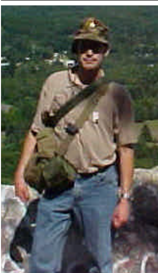
The editor during a hiking trip at Black Rock State Park in Connecticut.