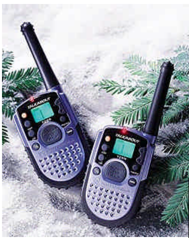
A pair of Motorola FRS radios

Both FRS and CB radios have a place in the survivalist's commo equipment inventory.