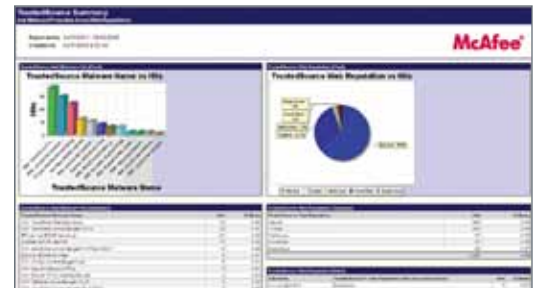
Advanced reporting capabilities provide all the detail and flexibility you need to understand your organization’s web traffic. You can even combine multiple graphs and tables from different queries in a single report or dashboard view.