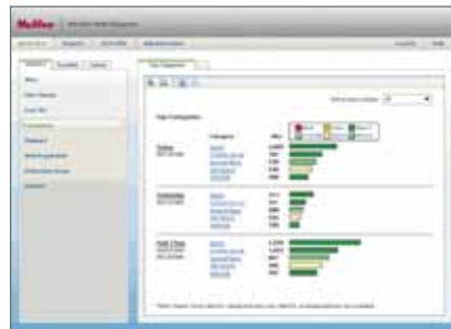
Quick View immediately displays actionable data each time you open McAfee Web Reporter, without the need to run a report. You can see additional data by simply clicking on an active link.