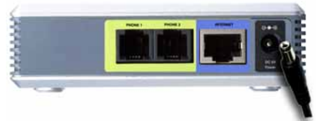
Figure 3-4: Connect the Power Adapter