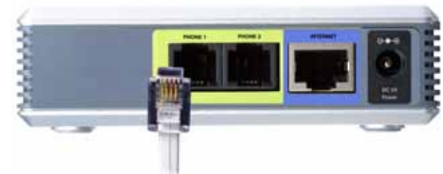
Figure 3-2: Connect the RJ-11 Telephone Cable

IMPORTANT: Do not connect either of the Phone ports to a telephone wall jack. Make sure you only connect a telephone or fax machine to either of the Phone ports. Otherwise, the Phone Adapter or the telephone wiring in your home or office may be damaged.