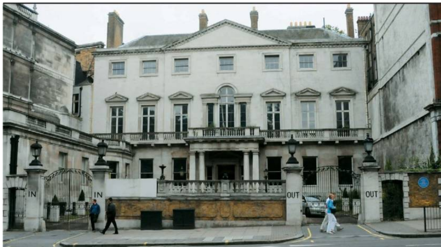
Long gone in Piccadilly - the 'In and Out Club'

How a relative helped crack a KGB bug puzzle and recruit a most controversial intelligence officer