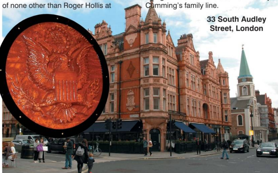
33 South Audley Street, London

33 South Audley Street, London In later years Hollis would go on to head the Service, but Wright always believed he was KGB - a claim vigorously rejected by MI5 even today.