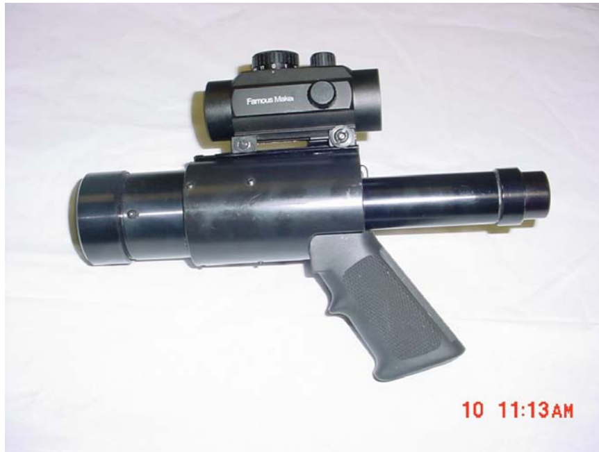
Handheld with Red Dot Recital Scope