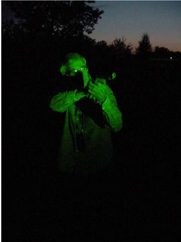
Holding a Colt 45