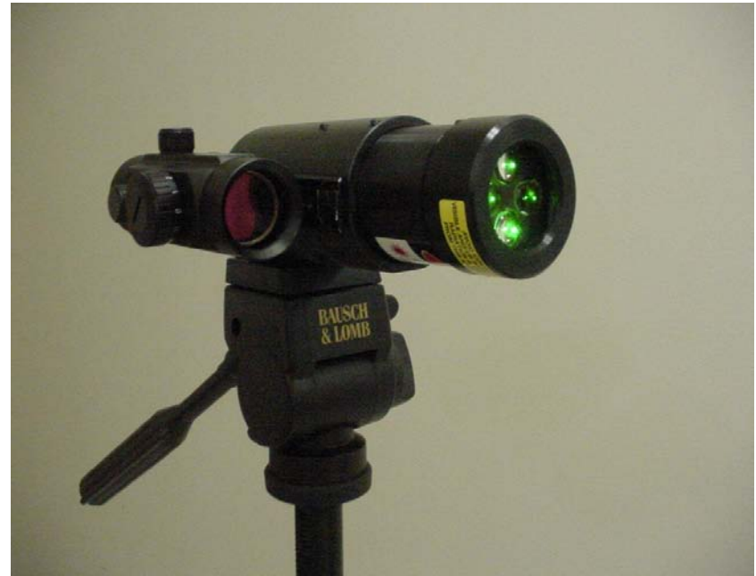
Handheld mounted on Tripod