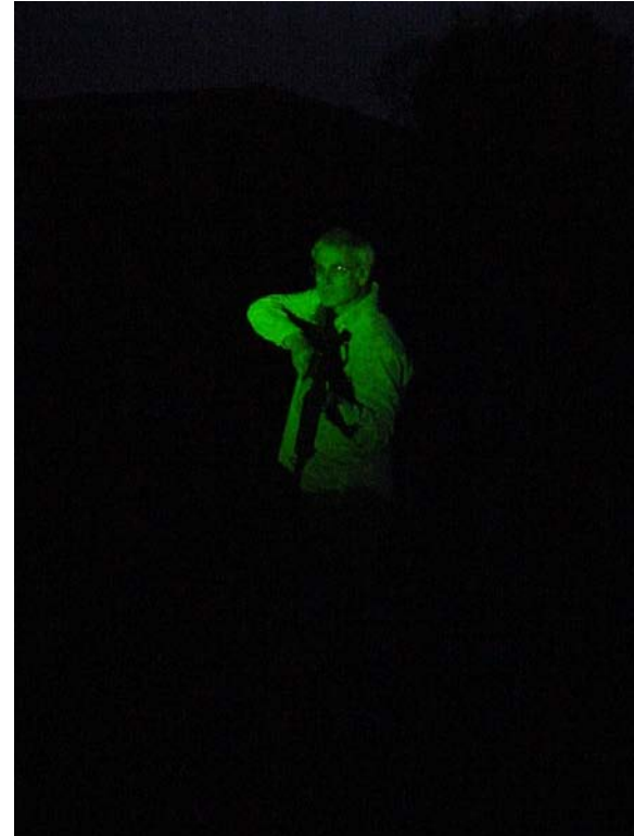
Holding an AR-15