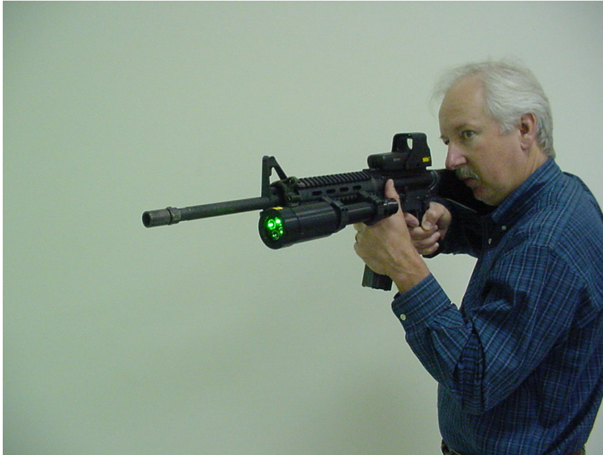
Mounted on AR-15