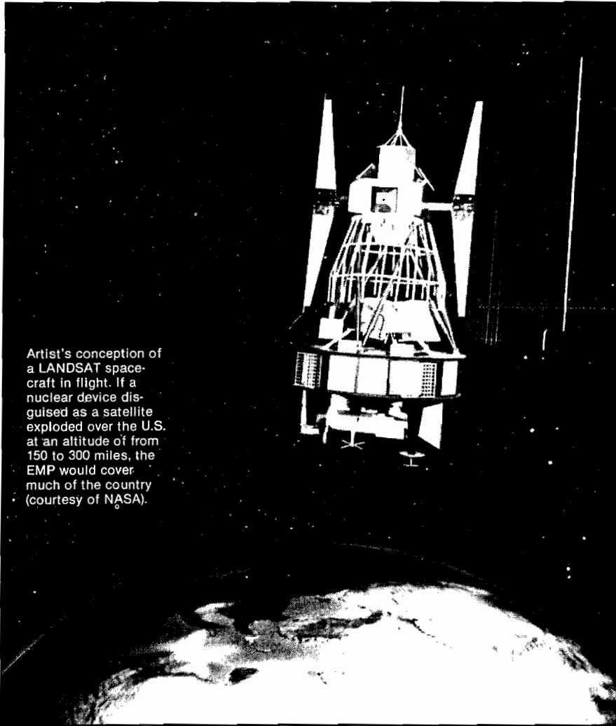
Artist's conception of a LANDSAT spacecraft in flight. If a nuclear device disguised as a satellite exploded over the U.S. at an altitude of from 150 to 300 miles, the EMP would cover much of the country.

E MP, electromagnetic pulse, is the enormous radio spectrum energy given off whenever an atomic weapon is detonated.