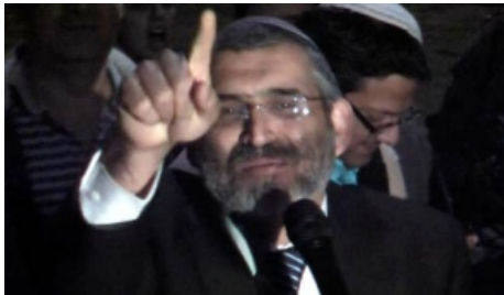
MK Michael Ben Ari during a rally in Tel Aviv, Dec. 11, 2011.

The protesters, who were also joined by several of the area's residents, amassed near Levinsky Park in southern Tel Aviv, an area heavily populated by African migrants.