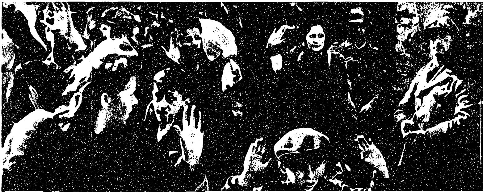
In the fury of the Nazi terror—Jews are rounded up by German troops on the streets of Warsaw. This picture was made by the German Army photographic and cinema service.