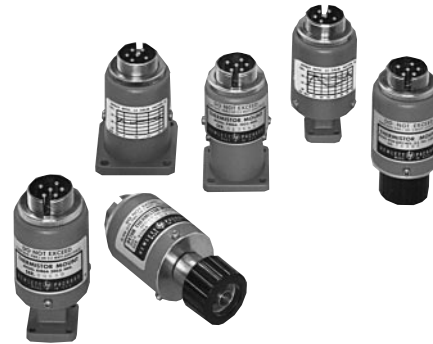
HP Thermistor Mounts

HP 432A HP 8477A HP 478A HP 8478B HP 486A Series